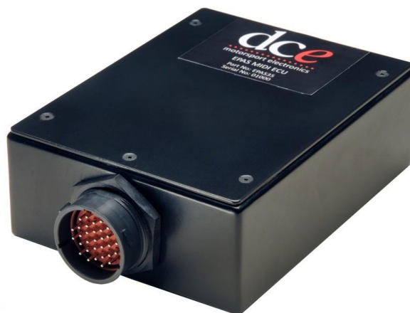
EPAS Midi ECU

The EPAS Midi ECU is designed to work with the DCE EPAS01 Column Assist unit as well as OEM steering Columns from GM such as the Opel Corsa/Holden Barina MKB & C