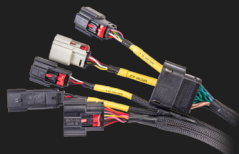
Plug-and-play wiring harness