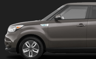
2014+ Kia Soul