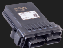
Master Control Module (MCM)