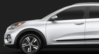
2017+ Kia Niro